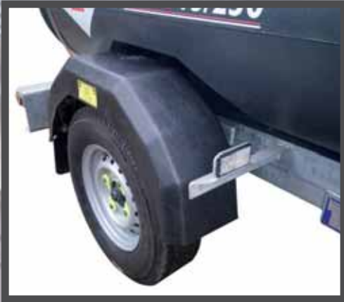
MOULDED MUDGUARDS, SIDE REFLECTORS & WHEEL NUT INDICATORS