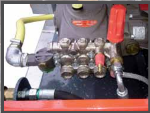
HIGH QUALITY TRIPLE PISTON PUMP WITH THERMAL PROTECTION & INLET STRAINER