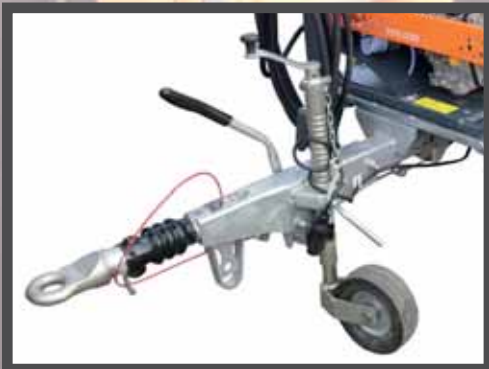
40MM TOWING EYE, BREAK-AWAY CABLE & TELESCOPIC JOCKEY WHEEL / JACK (OPTIONAL 50MM BALL HITCH ALSO AVAILABLE)