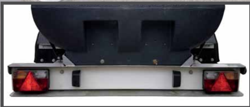
INTEGRATED LIGHTING EQUIPMENT COMPLETE WITH 13-PIN PLUG AND 7-PIN ADAPTOR