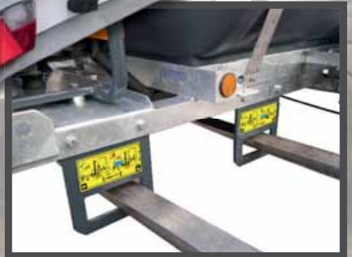
FORKLIFT POINTS FOR SAFE ON-SITE TRANSPORTATION