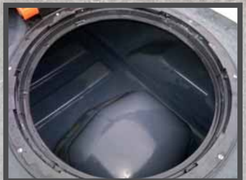
GENEROUS 550MM TANK MOUTH & INTERNAL TANK Baffle