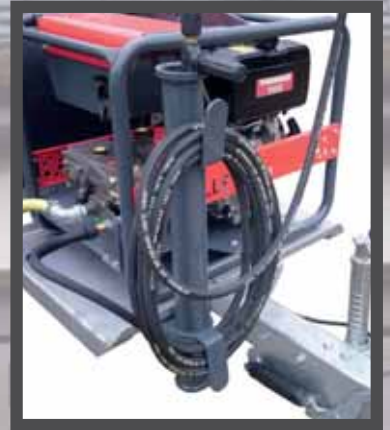
LANCE HOLDER INTEGRATED INTO THE TRAILER WITH HOSE STORAGE HOOKS