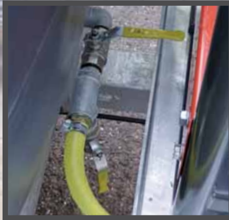
TANK AND PUMP DRAIN TAPS TO PREVENT FREEZING